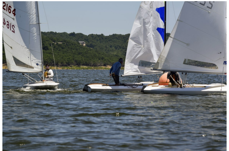
It can get crowded at the marks, good rules to learn.

Lots of experienced racers might skip the skipper's meeting for races they've done before, but as a newbie, definitely schedule that into the plan. There you can solid-