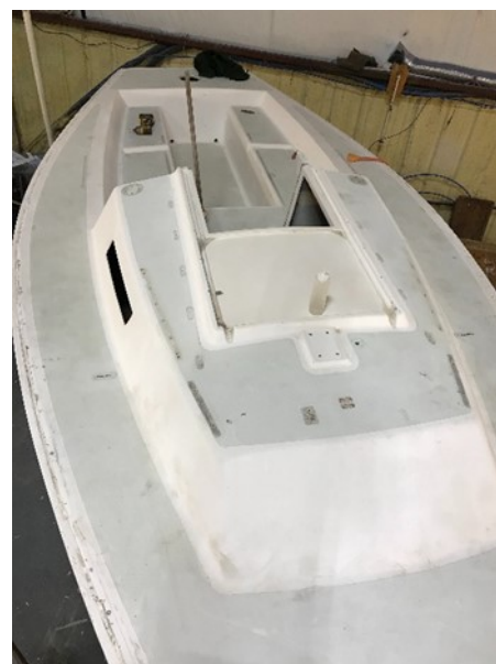
J22 hull, completely naked, ready for primer.

"Twenty years from now you will be more disappointed by the things that you didn't do than by the ones you did do. So throw off the bowlines. Sail away from the safe harbor. Catch the trade winds in your sails.