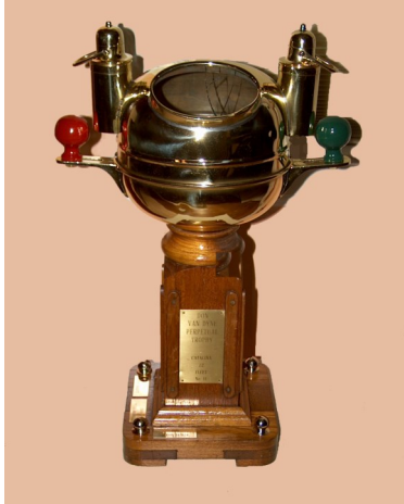
Van Dyne Trophy First Catalina 22 to finish at the Labor Day LDR.