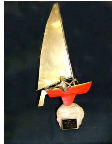
Hobock Trophy First Centerboard to finish at the Labor Day LDR.