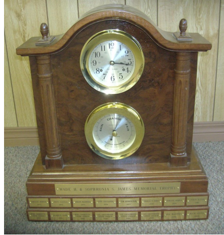
Wade James Trophy First Keelboat to finish at the Labor Day LDR.