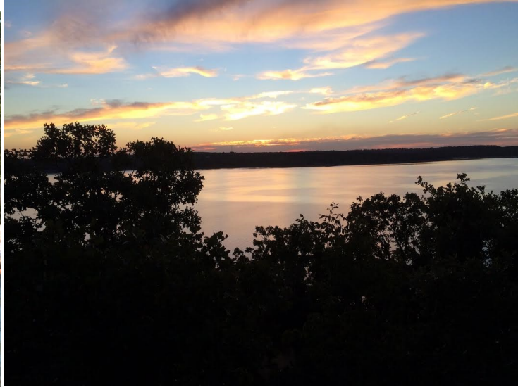
Catalina 25/27's, MC Scow, keelboat handicap fleet meeting at the Keithline home overlooking Keystone lake. September