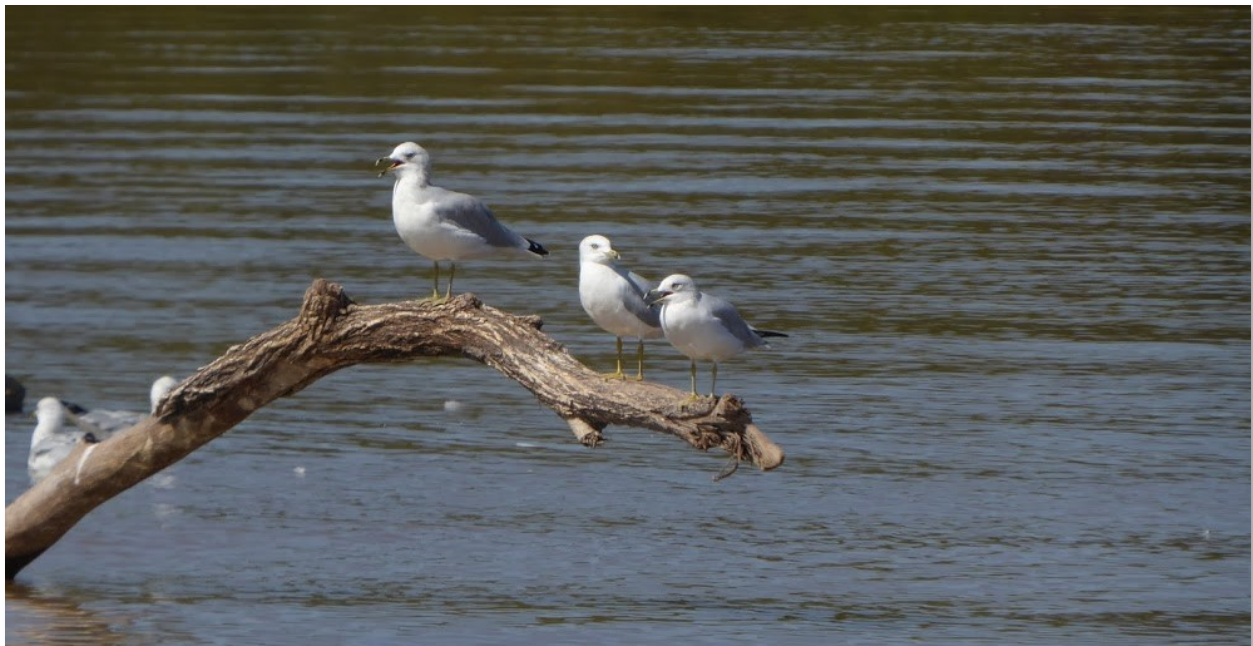
Ring-billed gulls are back in town