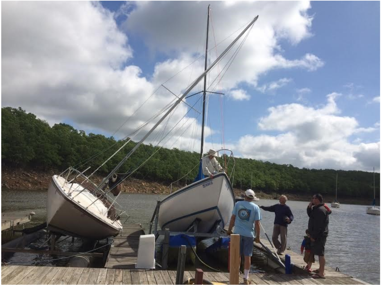
April 26th-rough night at the lake