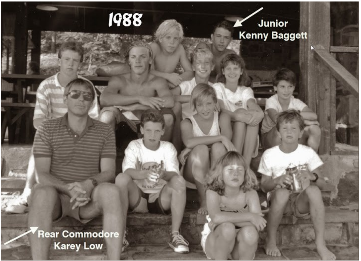
Yesteryears at Windycrest