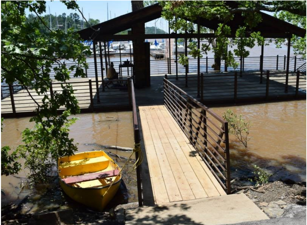
June 8th water level, slowly receding