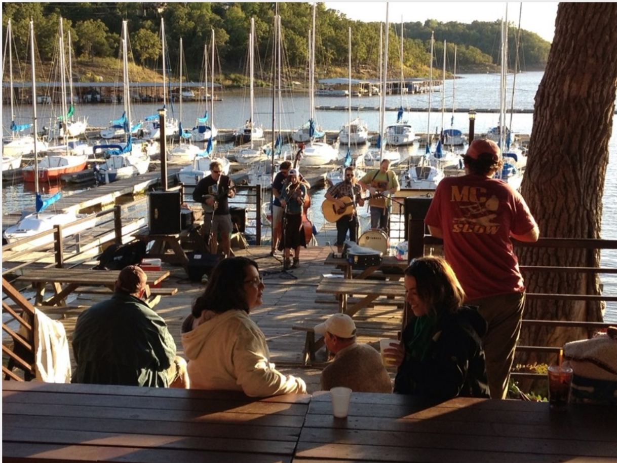
KlondikeFive Stringband playing on the deck during the MC Scow Southwest Championship. Great entertainment and a cook your own steak dinner topped of a great day of sailing.