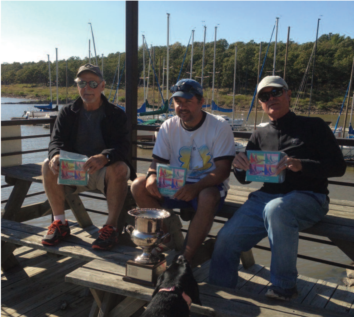
2013 Windycup Winners