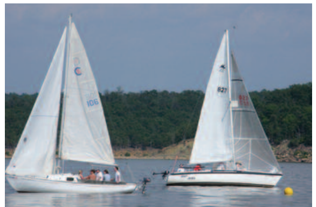
First and Last