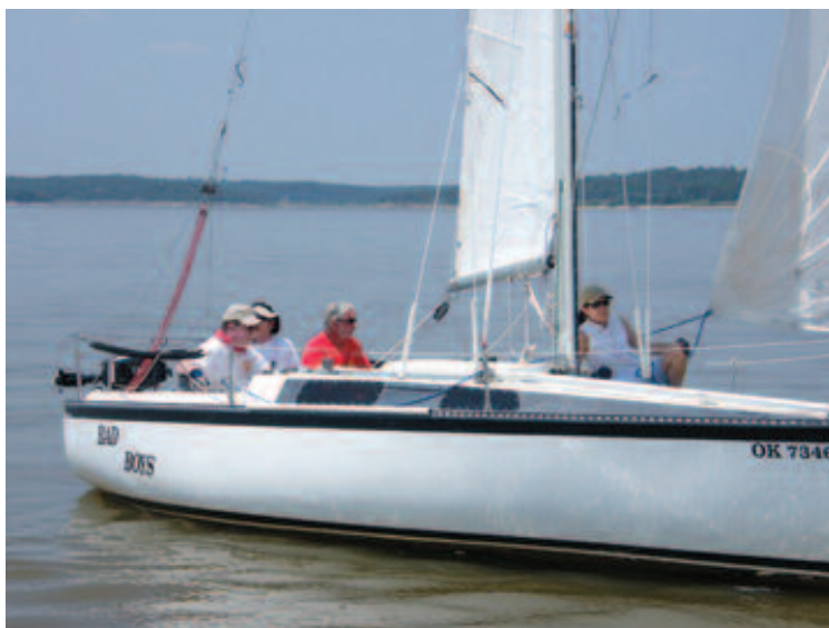
Bad Boys and Good Girl