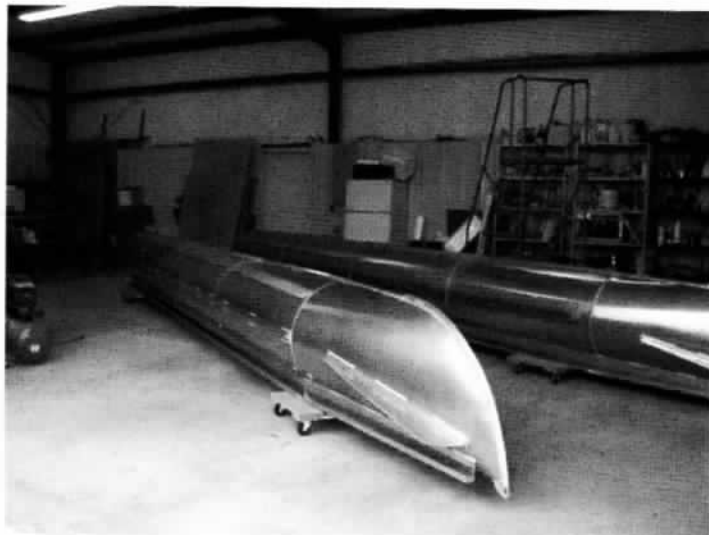
They only look like missiles.