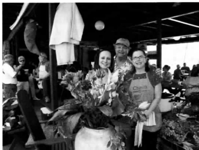
2007 Chili Cookoff