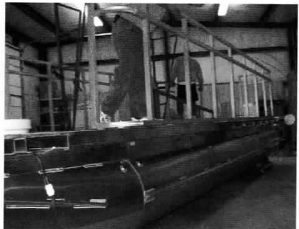
Progress as of March 30th!