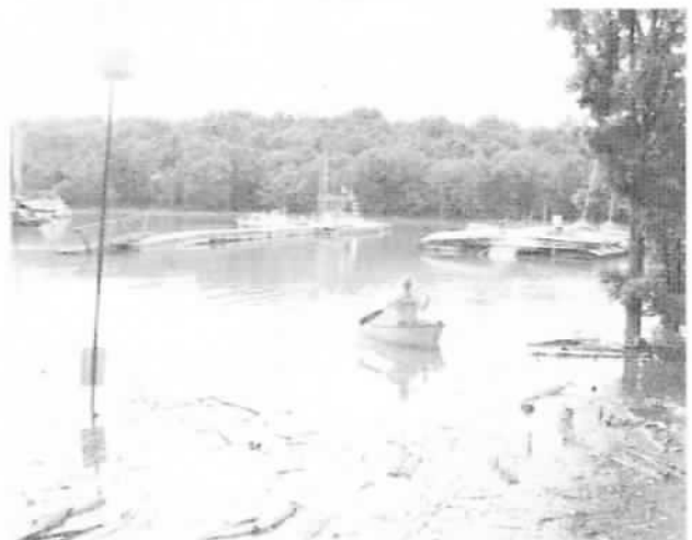
July 2, 2007