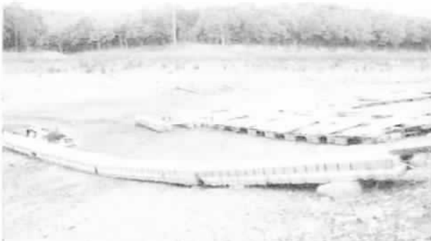
Opposite of Flooding, 2005 (?) That's the board boat dock/junior dock, FYI.