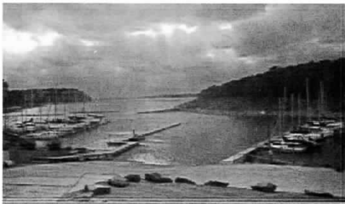
Oct. 14, 2007